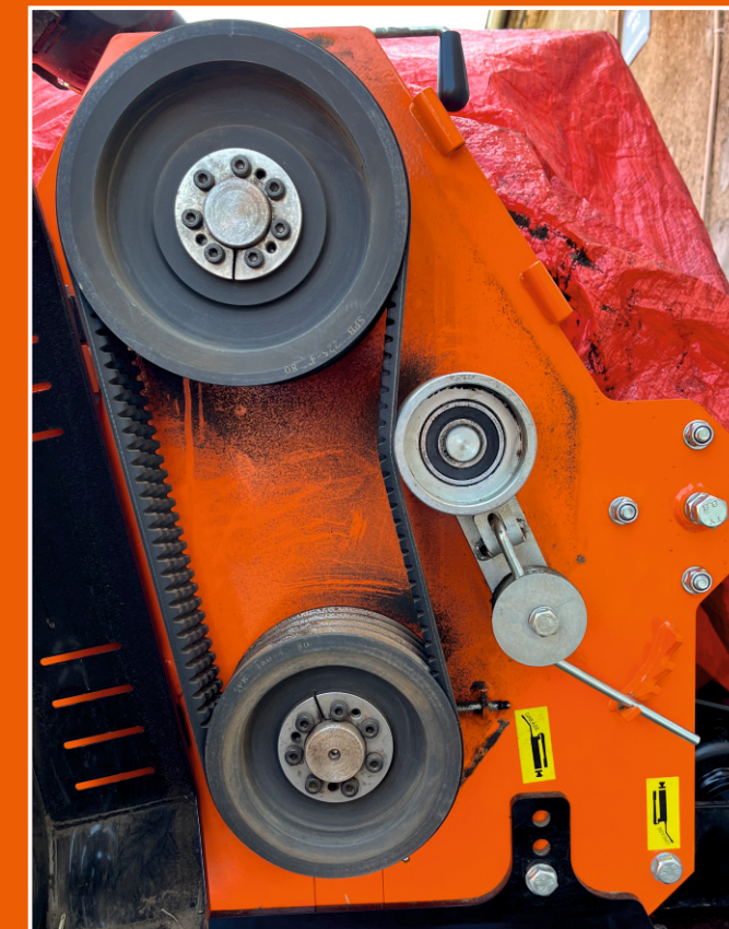
FOUR DRIVE BELTS WITH A TENSIONER