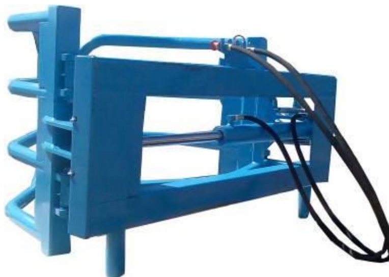
Fig. 2 Bale gripper

CAUTION: The first figure presents the correct arrangement of hydraulic hoses. If the arrangement is incorrect, the hoses may be damaged. The manufacturer will not accept any liability in this case.